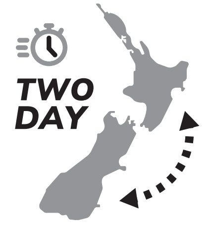
Two-Day Inter-Island (TD)